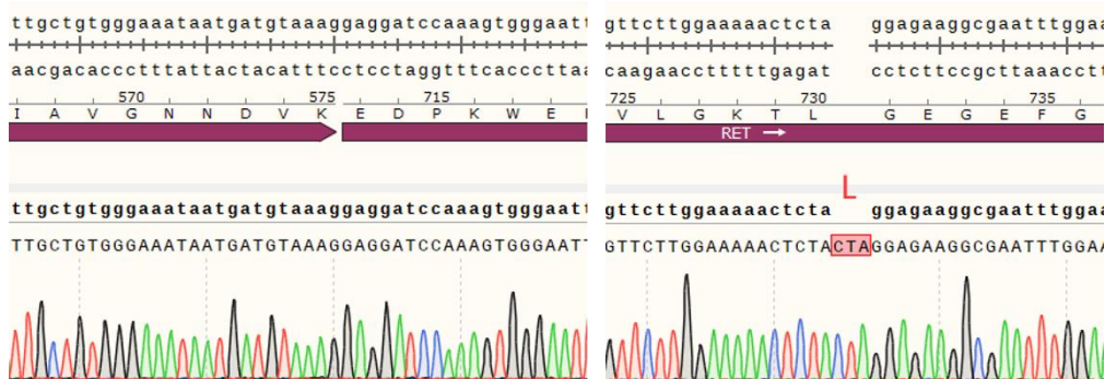
Figure 2 | The KIF5B-RET mutation analysis by Sanger sequencing.